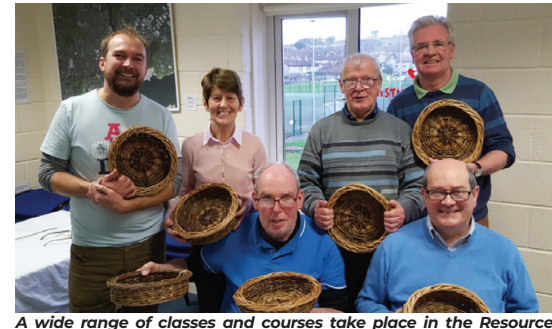
A wide range of classes and courses take place in the Resource Centre.

The Centre provides a link between people in the community and a range of important services. People call to the Centre seeking information, perhaps wanting to volunteer or participate in local initiatives or simply to join in one of the classes or activities. All are welcome. Westside Resource Centre may have exactly what they are looking for... If we don't, we may know someone who