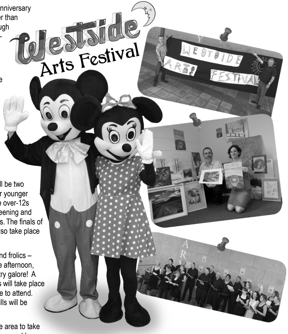
Images from last year's Westside Arts Festival

Westside Arts Festival invites everyone in the area to take part in this year's events and help make it a memorable occasion. Full programme of events available at: www.facebook.com/westsideartsfestival