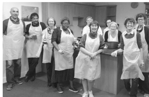
Participants in the Cookery Course organised by Galway City Partnership – Westside Project.