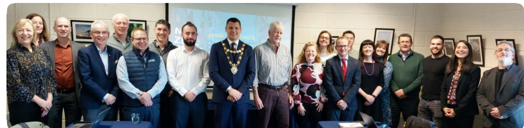
Mayor of the City of Galway Cllr. Eddie Hoare showing his support for the Steering Group of Galway's Net Zero Pilot City Project at their inaugural meeting. The project is an initiative of Galway City Council, Atlantic Technological University, Galway Energy Co-operative, North Western Regional Assembly and University of Galway. The project has received funding from the European Union.